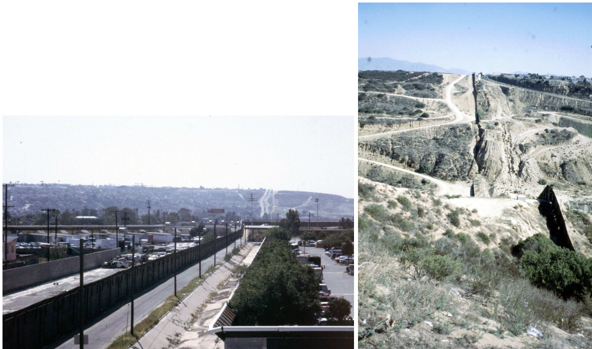
Figure 2: The US-Mexico border in the San Diego-Tijuana area

workers away, programs like 'Gatekeeper' (1994), 'Hold the Line' (1994) and 'Safeguard' (1999) have been put into operation. They changed the border in a highly militarized zone, with high steel walls and high-technology detection equipment that is much grimmer than its popular name 'Tortilla Curtain' suggests (figure 2).