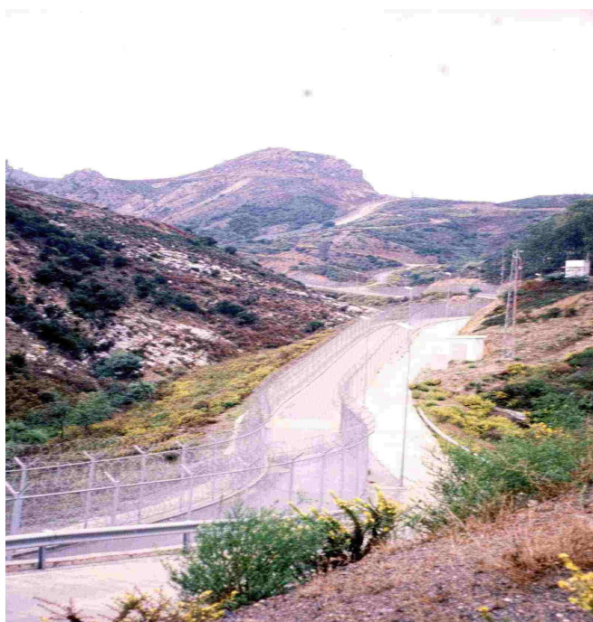
Figure 3: The Spanish-Moroccan border at Ceuta

Within Europe we can distinguish four types of ‘interdependent borders’. Nearly a copy of the US-Mexican border is the Spanish-Moroccan border near the Spanish enclave Ceuta (figure 3). The